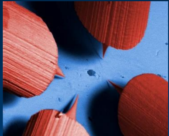
Four tips on a Si surface

(Applications must include CV, certificates, lists of publications and talks, short description of interest in the subject)